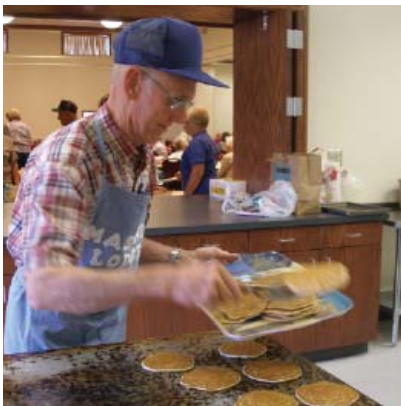
Pancakes & fresh sausage will be on the menu in Fairview Feb. 11th.

Participants will be entertained with live music while they eat and door prizes will be given. In addition, a baked goods auction will take place throughout the evening. A large variety of cakes, pies and cookies will be up for bid. This will be a good chance for attendees to pick up a sweet treat in time for Valentine's Day.