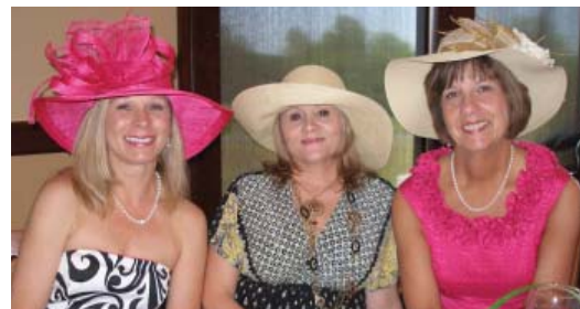
Mint Julep Jubilee Participants are encouraged to wear Derby Day attire.

event is planned for May 5th at 4:00. It will also include southern style hors d'oeuvres and drinks such as mint juleps. After the race is over the event will continue with a casino night. Other features of the Jubilee include a best hat contest, a "horse auction" with a 50/50 pot and the chance to win a great prize through wagers for the winning horse. Tickets