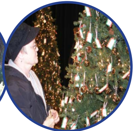
Nearly 500 ornaments adorned trees at our Tree of Life Celebrations in December.