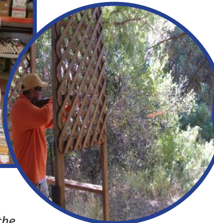
Hospice Circle of Love hosted a Clay Shoot at Cimarron Junction in October.